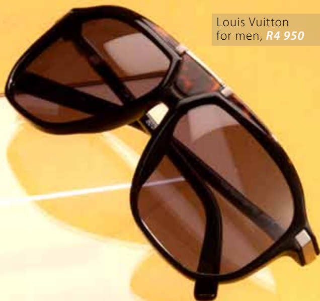
Louis Vuitton for men, R4 950