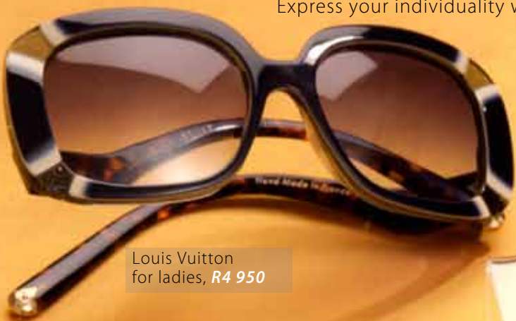
Louis Vuitton for ladies, R4 950