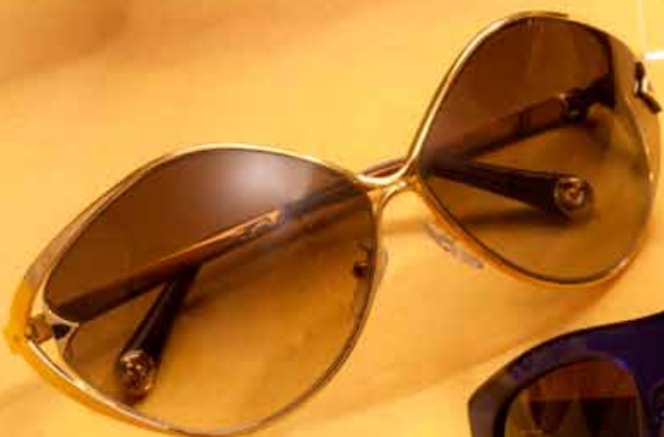
Louis Vuitton for ladies, R4 650