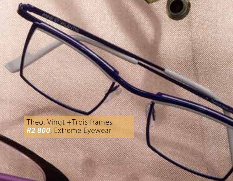
Theo, Vingt +Trois frames R2 800, Extreme Eyewear