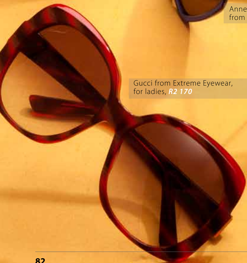
Gucci from Extreme Eyewear, for ladies, R2 170